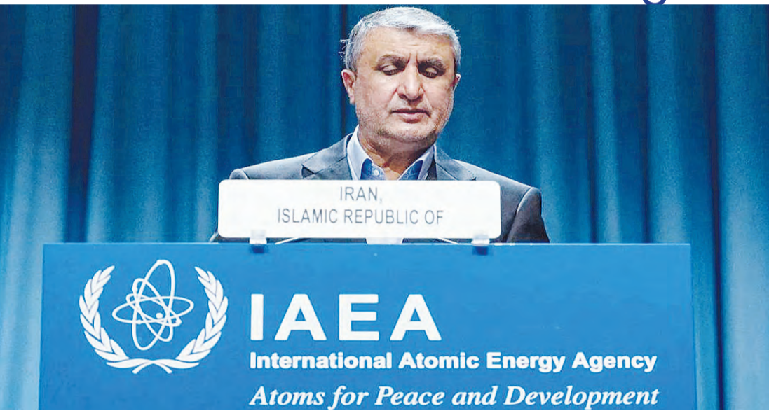
IRAN NEWS ECONOMIC DESK