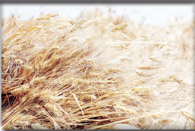
The fifth loaded cargo is stuck at Ukraine's Chornomorsk Port but is expected to sail once it has the green light from port officials, according to traders. Turkish Defense Minister Hulusi Akar unveiled a centre in Istanbul on Wednesday that would oversee the export of Ukrainian grains, with the first shipment expected to depart from Black Sea ports within days.