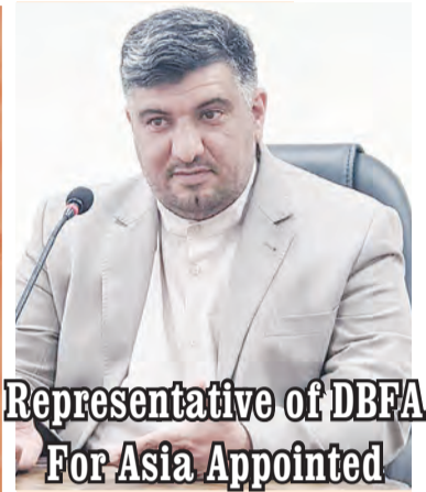
Representative of DBFA For Asia Appointed IRAN NEWS SPORTS DESK

His big goal is the U.S. Open, a tournament he hasn't played since 2019. His eternal rival Djokovic will not be able to travel to the United States (not being vaccinated against the Coronavirus), unless unlikely last minute changes. Shortly before Wimbledon, the 22-time Grand Slam champion confirmed that he will become a father.