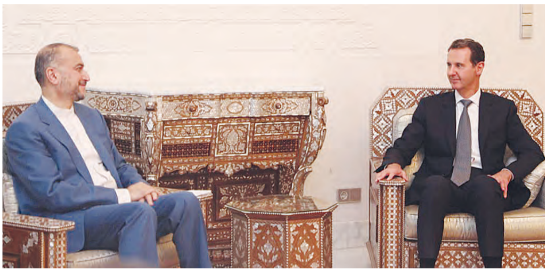
IRAN NEWS POLITICAL DESK

TEHRAN - Foreign Minister Hossein Amirabdollahian and Syrian President Bashar al-Assad met in Damascus on Saturday.