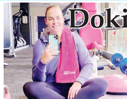
Dokic, who sprang to prominence at Wimbledon in 1999 when she stunned world number one Martina Hingis in the first round, said she has been suffering with mental illness and nearly resorted to suicide on April 28.

SYDNEY (Dispatches) - Australian former tennis star Jelena Dokic revealed on Monday that she came close to taking her own life just a few weeks ago.