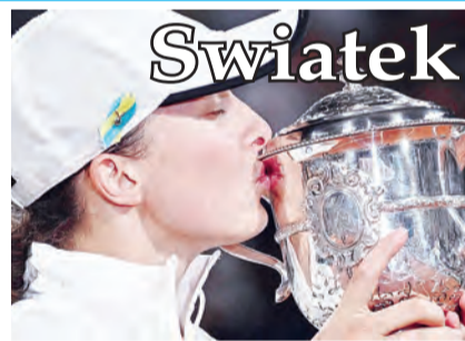
And after claiming her 35th successive victory in Roland Garros, she now has over 4,300 points advance on new world number two Anett Kontaveit of Estonia.

The 11th-ranked player said: "I don't think anyone would say, 'I wish I didn't wish a Grand Slam at 18' because that is what I set out to do when I started playing tennis -- and I did that."