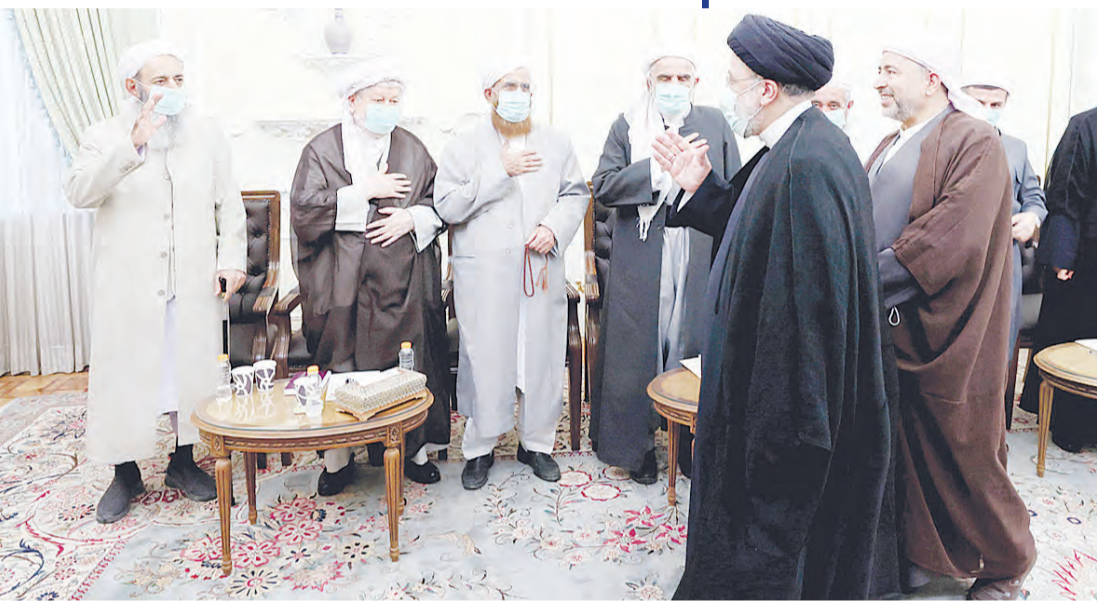
IRAN NEWS NATIONAL DESK