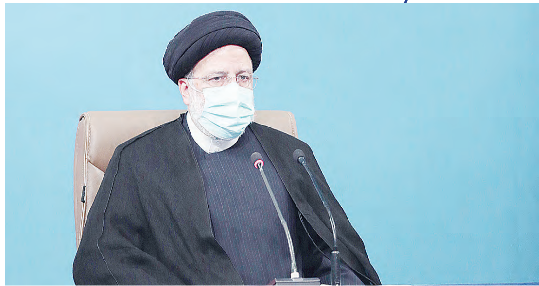
IRAN NEWS NATIONAL DESK

TEHRAN - Emphasizing that a strong Iran is inconceivable without a principled education and promotion of education, President Seyed Ebrahim Raisi said, "What is spent in the field of education is investment to ensure the future development and progress of the country".