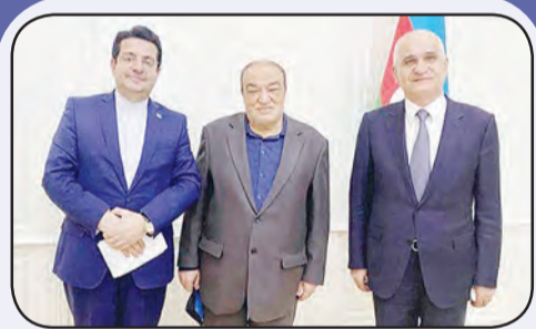
IRAN NEWS NATIONAL DESK

TEHRAN - A number of discussions were conducted on joint projects between Azerbaijan and Iran on Monday in Baku.