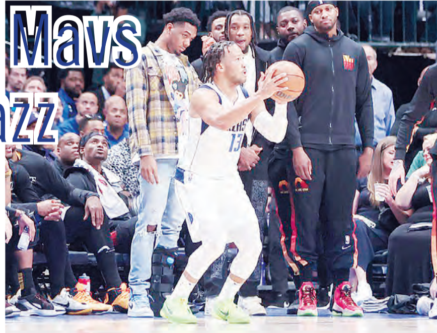
his second technical foul and earning an ejection with seven minutes remaining.

Nikola Jokic recorded 26 points and 11 rebounds for the Nuggets before drawing