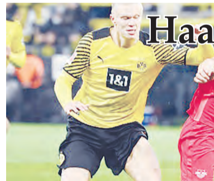
€75 million release clause attached to any move.

Real Madrid, Paris St Germain and Manchester City are reportedly interested in Haaland, who has scored 16 goals in 18 league games for Dortmund this season