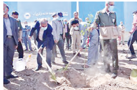
IRAN NEWS ECONOMIC DESK

TEHRAN – Concurrent with the National Tree Planting Day and Natural Resources Week, hundreds of tree saplings were planted at Chadormalu Mining and Industrial Complex.