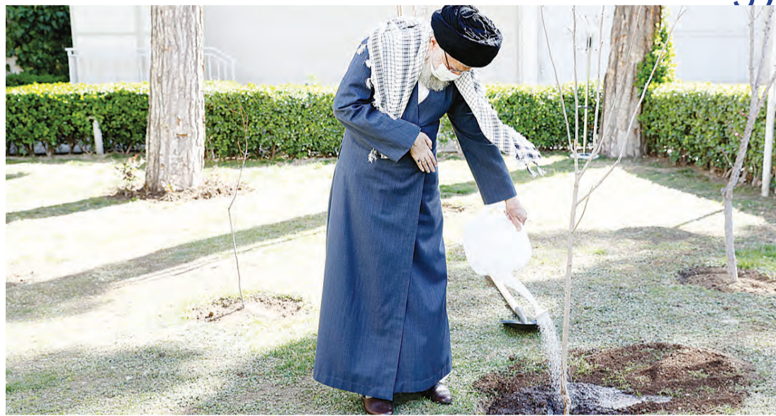
IRAN NEWS NATIONAL DESK

TEHRAN - Supreme Leader of the Islamic Revolution Ayatollah Seyed Ali Khamenei has stressed the need for further development of renewable and clean energy sources, such as civilian nuclear energy, to replace fossil fuels.