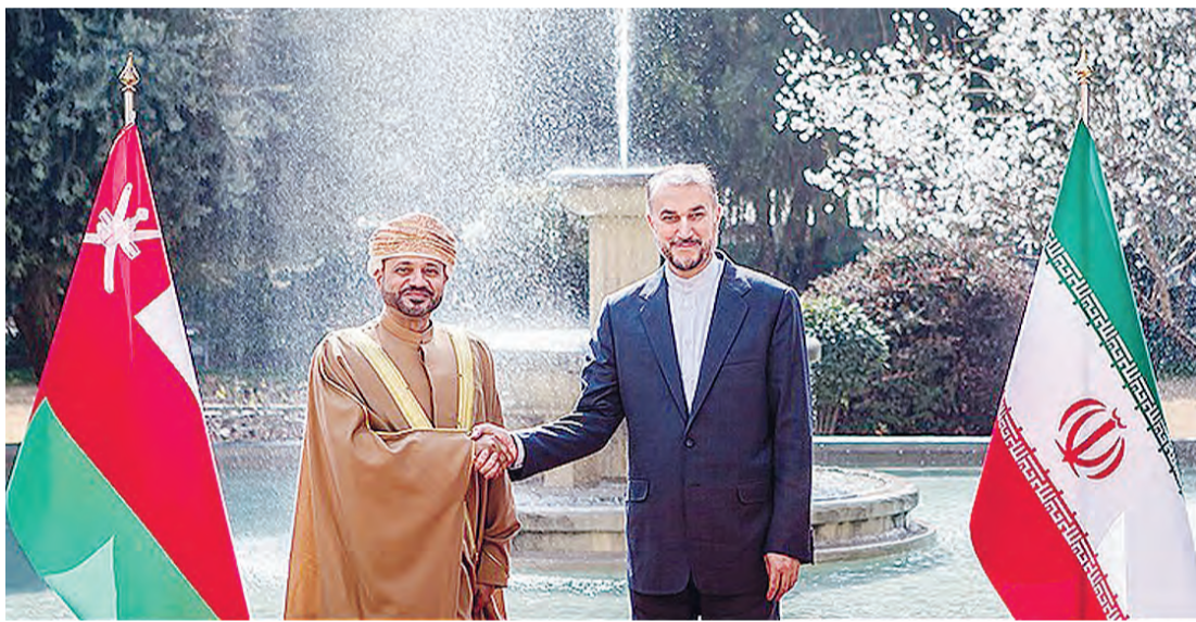
IRAN NEWS POLITICAL DESK

TEHRAN - Foreign Minister Hossein Amir-Abdollahian says Iran has informed the Western parties that it will never cross its own red lines in the Vienna negotiations aimed at putting the 2015 nuclear deal back on track.