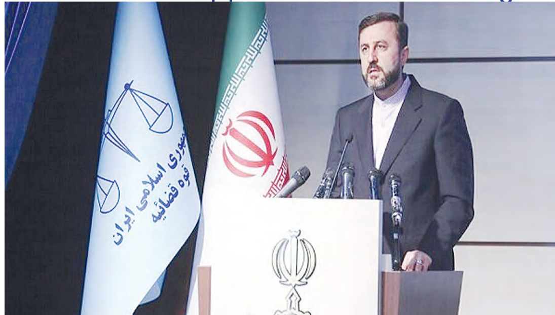
IRAN NEWS POLITICAL DESK

TEHRAN - Iran has slammed insincere Western concerns over human rights issues, saying murderers of Iranian people are roaming freely in Europe while European officials remain silent.