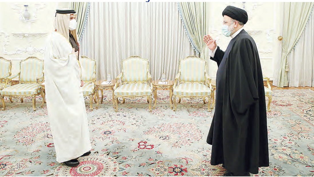
IRAN NEWS POLITICAL DESK