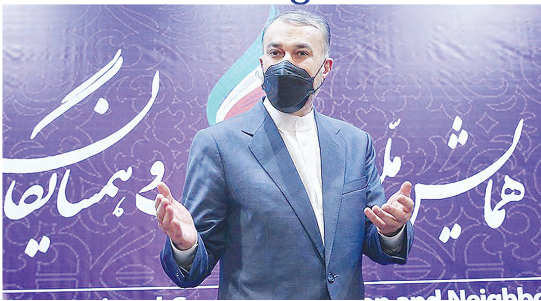
IRAN NEWS POLITICAL DESK

TEHRAN - The enhancement of relations with the neighbors constitutes a top priority in Iran's foreign policy agenda, Foreign Minister Hossein Amir-Abdollahian said yesterday in the closing ceremony of the First National Conference and Neighbors in Tehran.