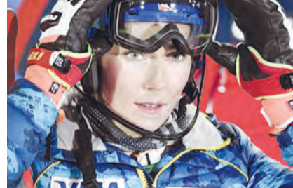
she will hope to add to the slalom gold she won in 2014 and the giant slalom title in 2018. "Unfortunately I had a positive COVID test. I'm following protocol and isolating, & I will miss Lienz," she tweeted.

PARIS (Dispatches) - American double Olympic alpine ski gold medalist Mikaela Shiffrin has tested positive for Covid-19, she announced on social media on Monday.