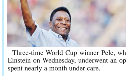
Three-time World Cup winner Pele, who was admitted to Sao Paulo's Hospital Albert Einstein on Wednesday, underwent an operation to remove the tumor in September and spent nearly a month under care.