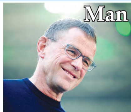
competitions which left them eighth in the Premier League standings.

M ANCHESTER (Reuters) - Manchester United have named German Ralf Rangnick as interim manager until the end of the season, the Premier League club said on Monday, eight days after sacking Ole Gunnar Solskjaer.