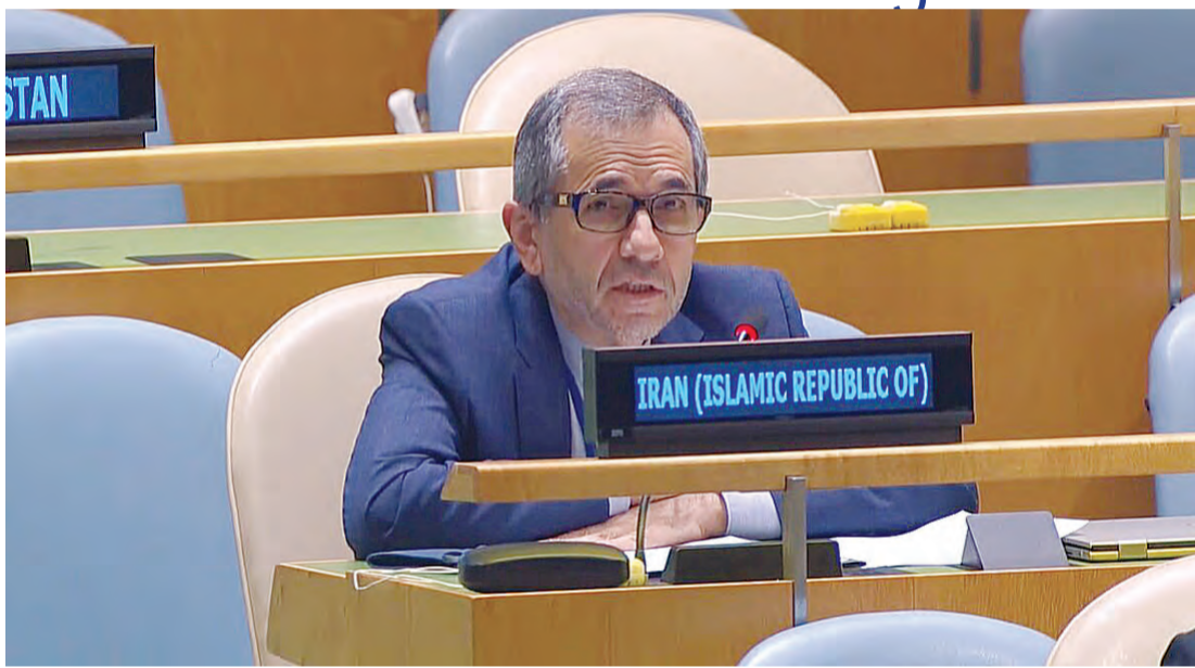
IRAN NEWS POLITICAL DESK

TEHRAN - Iran's UN ambassador has denounced Israel's clandestine nuclear program as "real threat" to the Middle East, saying the regime must join the Non-Proliferation Treaty (NPT) in the first step towards the realization of a region free of weapons of mass destruction (WMDs).