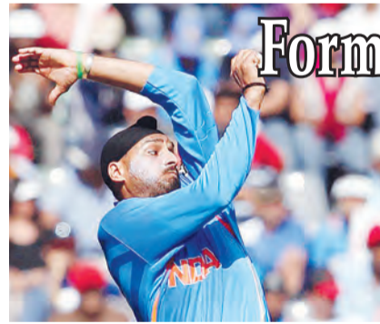
three formats and winning the 2011 ODI World Cup and the 2007 T20I World Cup.

NEW DELHI (Dispatches) - Former India off-spinner Harbhajan Singh announced his retirement from all forms of cricket on Friday, bringing down the curtain on a 23-year career in the sport.