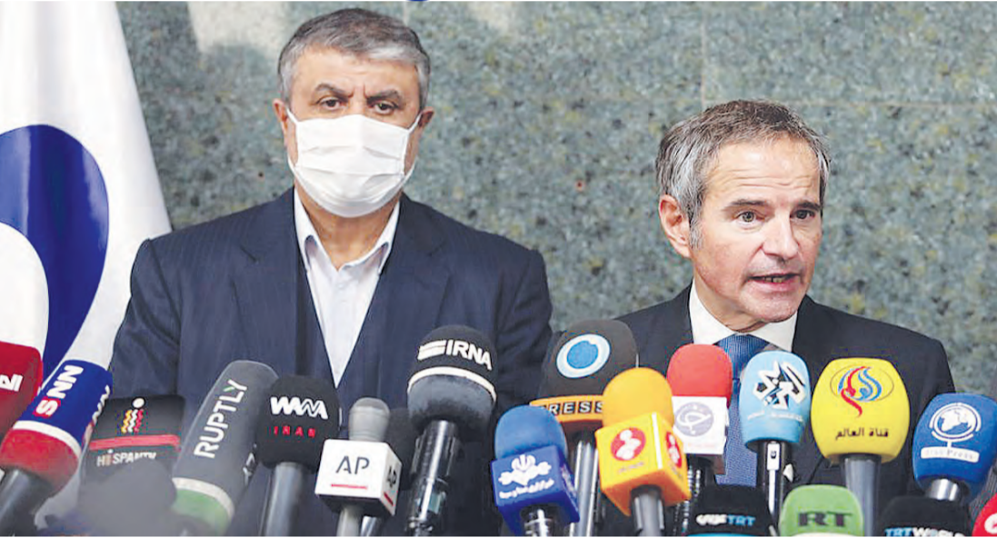
IRAN NEWS NATIONAL DESK