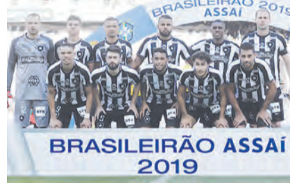
BRASILEIRÃO ASSAI 2019