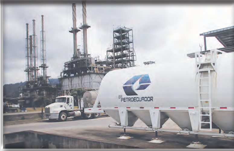
Another oil bidding round includes blocks in the Amazon which have high potential but face strong opposition from local indigenous communities. Ecuador currently produces around 485,000 bpd, mostly from Petroecuador.

"We have everything ready ... we have the contract model ready and we can hopefully launch this process in December this year," the minister said.