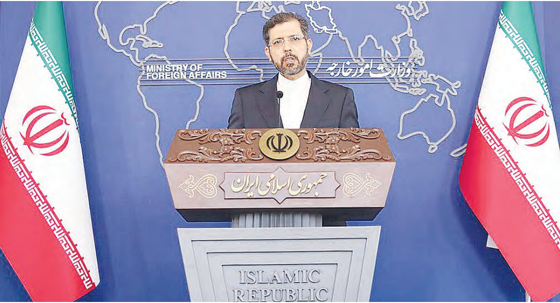
IRAN NEWS POLITICAL DESK