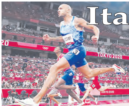
Krystsina Tsimanouskaya, who had been

TOKYO (Reuters) - Lamont Marcell Jacobs won the most coveted crown in athletics on Sunday, giving Italy its first 100 meters gold on a night of high drama in Tokyo.