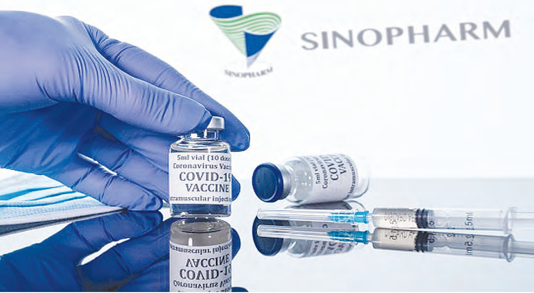
IRAN NEWS ECONOMIC DESK