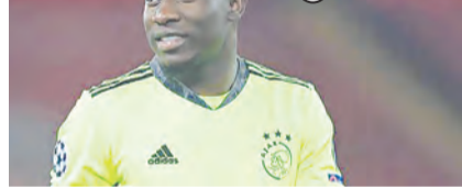
But the 25-year-old looks set to reunite with former Ajax coach Peter Bosz instead, with Dutch news outlet NOS reporting his agent confirmed a personal agreement

PARIS (Dispatches) - Lyon are in talks to sign Andre Onana from Ajax, the goalkeeper's agent has confirmed.