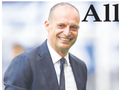
It would mark the end of a disappointing year in charge for Pirlo, who was appointed last summer with no prior coaching experience and could only lead Juventus to fourth

ROME (Reuters) - Juventus have sacked coach Andrea Pirlo and replaced him with former manager Massimiliano Allegri, Italian media reported on Thursday.