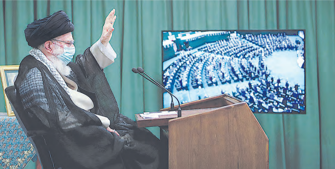
IRAN NEWS NATIONAL DESK