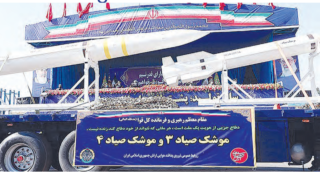
IRAN NEWS NATIONAL DESK