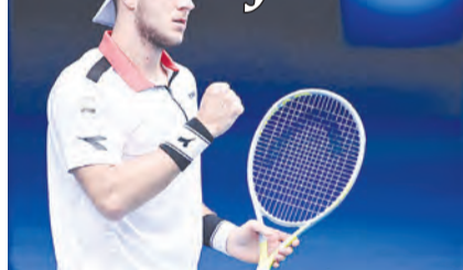
Sixth-seeded Australian John Millman needed three hours and 15 minutes to put away Argentina's Federico Coria, 7-6 (5), 3-6, 6-3. Other winners included 19-year-old Italian

ROME (Dispatches) - Fifth-seeded Jan-Lennard Struff of Germany saved five match points in a 1-6, 6-1, 7-5 victory over Portugal's Joao Sousa in first-round action Tuesday at the Sardegna Open in Cagliari, Italy.