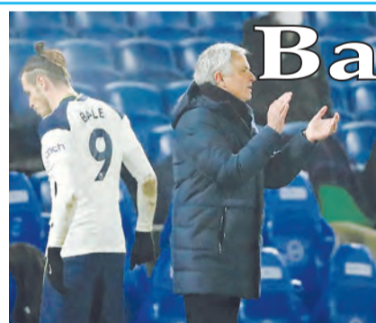
Europa League matches against Wolfsburg recently.

He could make a rare Premier League start against Burnley on Sunday after Tottenham boss Mourinho said he is playing with freedom again after the difficult end to his spell in Madrid, where he won the Champions League four times but was frozen out by boss Zinedine Zidane.