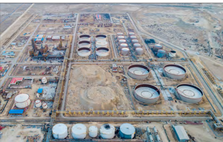
Inauguration of the largest bitumen refinery in Qeshm

Hassan Rouhani inaugurated the super-heavy crude oil refinery of Pars Behin Qeshm Oil Refinery Company with a foreign exchange investment of $ 164 million and a production capacity of 35,000 barrels per day. Pars Behin Qeshm Oil Refining Company is one of the subsidiaries of Pasargad Energy Development Company in the Qeshm Island Free Zone. The company is the private