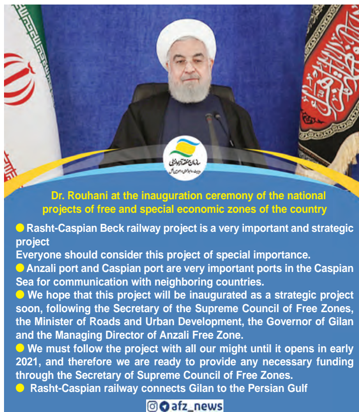
Dr. Rouhani at the inauguration ceremony of the national projects of free and special economic zones of the country