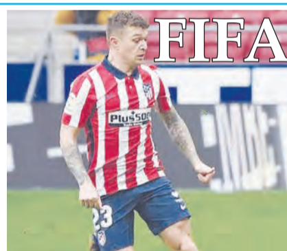
FIFA's decision taken late Saturday allows Trippier to return to play for Diego Simeone's side until the appeal is heard at a crucial period of the season.