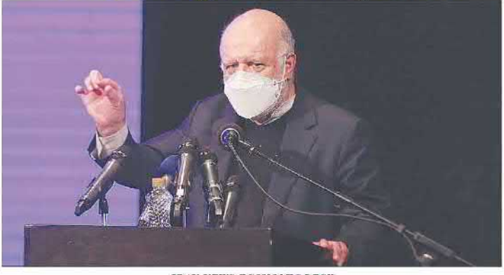
IRAN NEWS ECONOMIC DESK