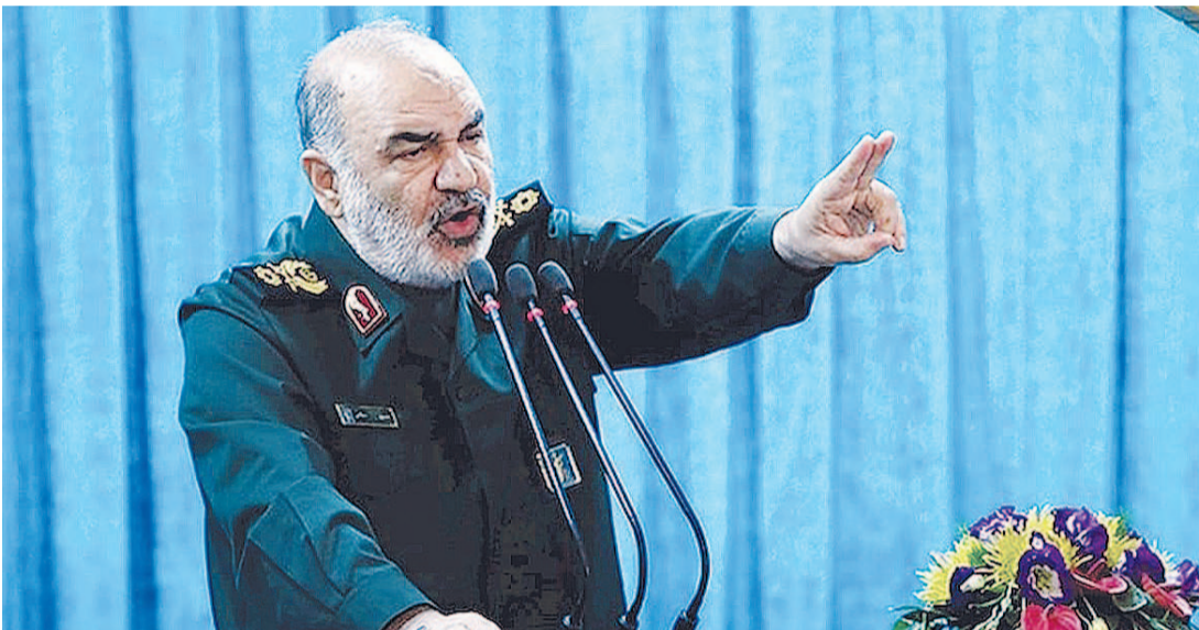
IRAN NEWS NATIONAL DESK

TEHRAN - The chief commander of the Islamic Revolution Guards Corps (IRGC) says Iran will definitely avenge the U.S. assassination of General Qassem Soleimani, but it will only target those who are either directly or indirectly involved in the murder.