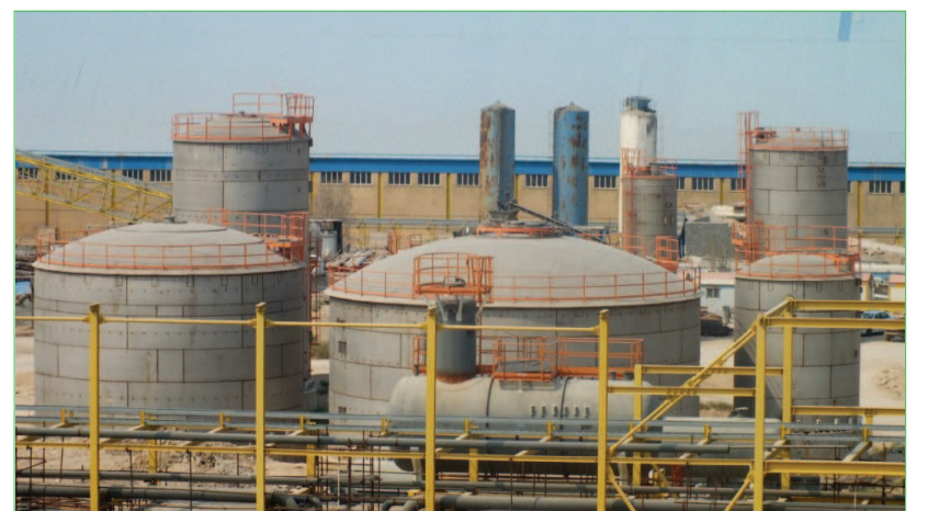
Overview of urea unit tanks