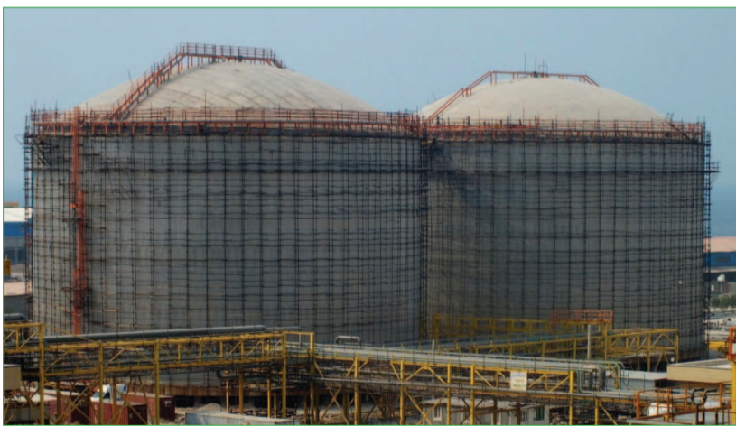
Overview of ammonia unit tanks