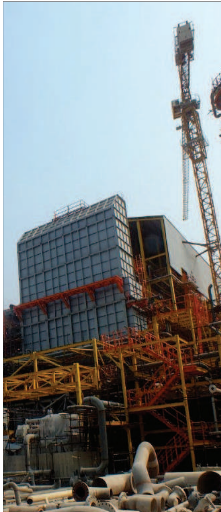
Overview of the reformer