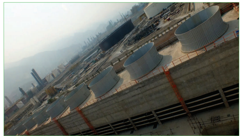
Overview of Cooling Tower