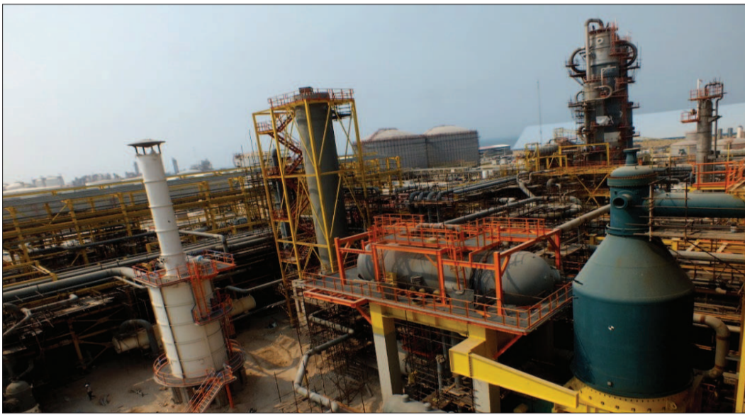
Overview of urea and ammonia units

Localization of some equipment by Iranian engineers that this equipment was previously imported from abroad.