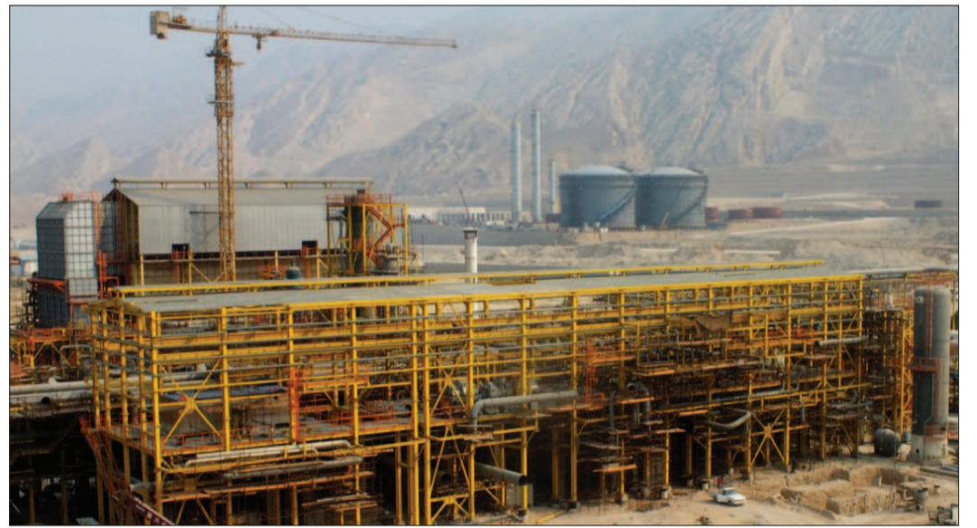
Overview of Shelter Compressor