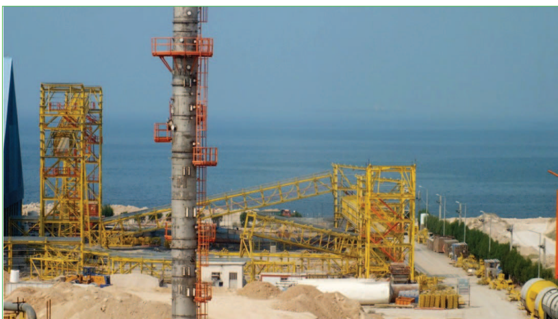
Overview of the metal structure of the urea unit