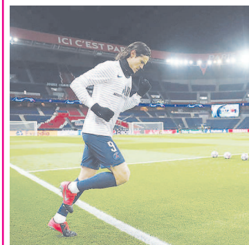
Cavani and Meunier for their comments.

Joelinton was also at the centre of the game's significant moment when he raced away from John Egan in the second half and was hauled back, triggering a red card for the Blades defender that sparked the visitors' collapse.